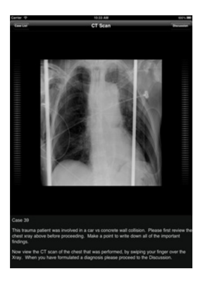
Figure 3 A radiology application shows a CT scan of the chest of a trauma patient [13]

The purpose of this study was to explore the pattern of medical PDA usage by Iranian interns and residents. All participants used PDAs for medical purposes. This situation reflects previous findings where most of the PDA-owning residents used it as an assistant tool in patient care delivery [8]. The most frequently used resources available on PDAs were clinical decision support resources (in particular UptoDate®) and pharmaceutical references that assist users in a quick review of drug properties. This practice pattern indicates that most uses of PDAs by residents/interns were those more directly associated with clinical care. This finding encourages further large-scale studies to examine whether a similar practice pattern is prevalent among other healthcare professionals, and to what extent it in-