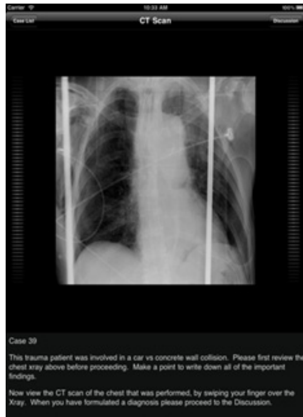
Figure 3 A radiology application shows a CT scan of the chest of a trauma patient [13]

The purpose of this study was to explore the pattern of medical PDA usage by Iranian interns and residents. All participants used PDAs for medical purposes. This situation reflects previous findings where most of the PDA-owning residents used it as an assistant tool in patient care delivery [8]. The most frequently used resources available on PDAs were clinical decision support resources (in particular UptoDate®) and pharmaceutical references that assist users in a quick review of drug properties. This practice pattern indicates that most uses of PDAs by residents/interns were those more directly associated with clinical care. This finding encourages further large-scale studies to examine whether a similar practice pattern is prevalent among other healthcare professionals, and to what extent it in-